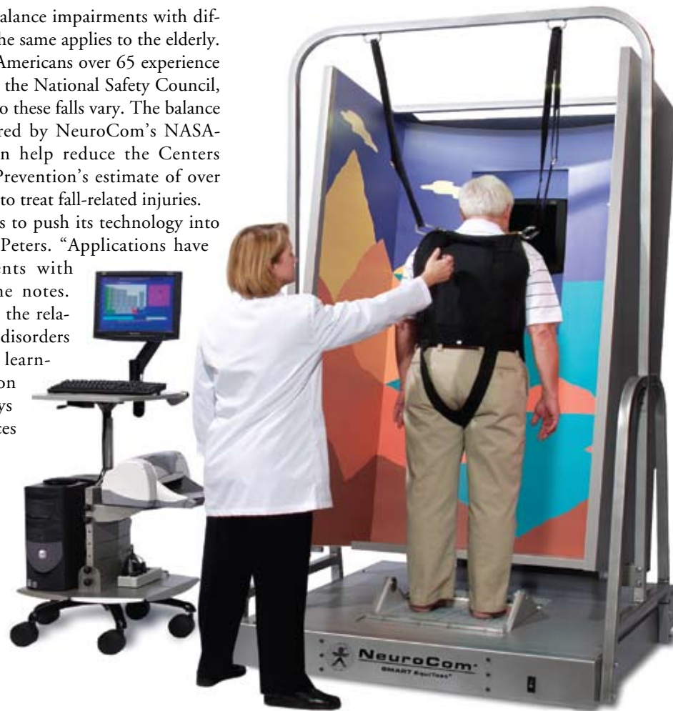
Developed from balance assessment research supported with NASA funding, NeuroCom's systems provide a versatile range of balance analysis and therapy options.

inVision ™, NeuroGames™, and NeuroPong™ are trademarks of NeuroCom International Inc.